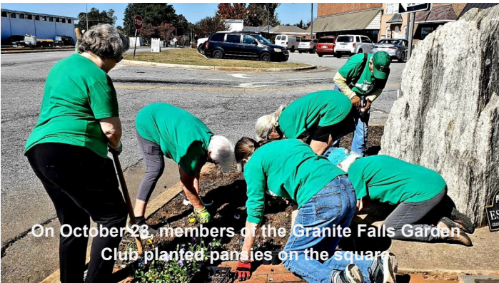
On October 23, members of the Granite Falls Garden Club planted panels on the square.